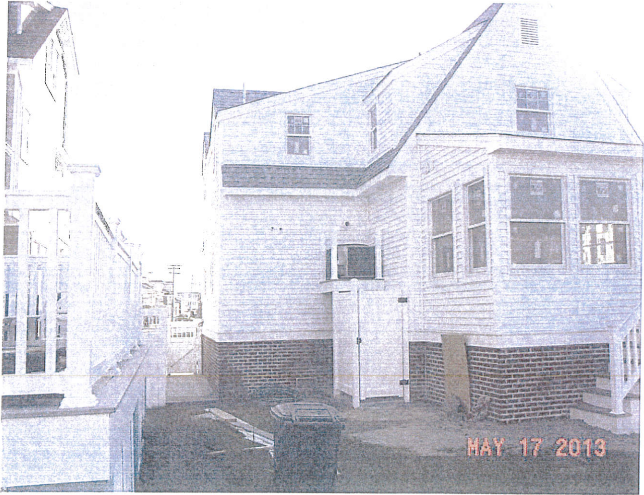
View Rear / Right